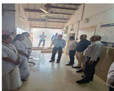
State Team Review