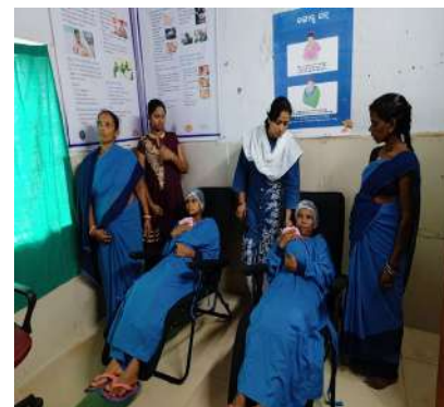
FPC / KMC Service by Staffs