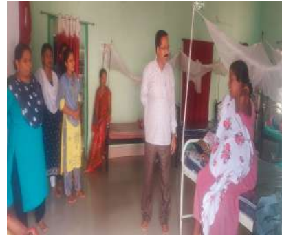
NGO Secretary visit to Maa Gruha