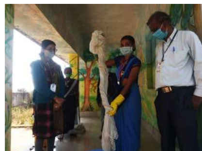
Mosquito Net demonstration