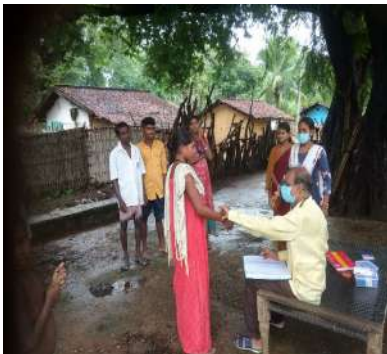
Village health camp