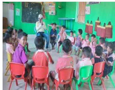
Yoga Class at Anganwadi Centre