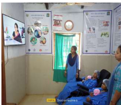
FPC / KMC Services by Staffs