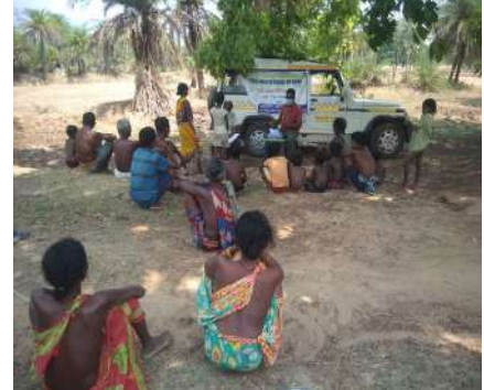
Health Check up camp