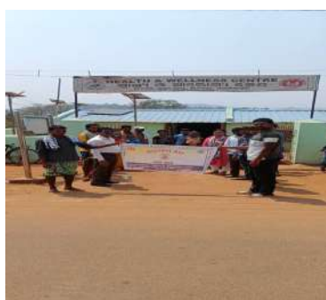
Malaria Day Celebration