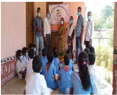
School Programm by Arogya