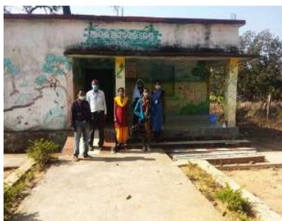
A W C visit by team