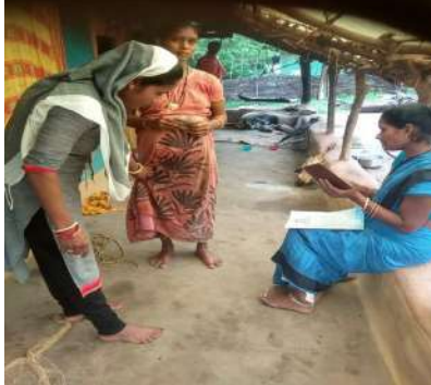
A N C Mother check up