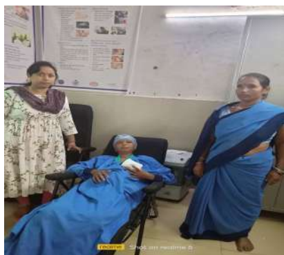
KMC Services by ANM, PHC (N)