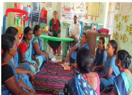
GKS Meeting at Badapada