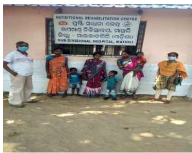
Child Referral to NRC