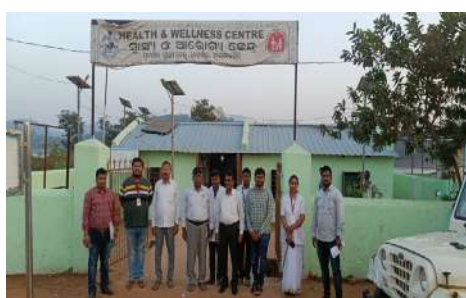
Dist. Team Visit