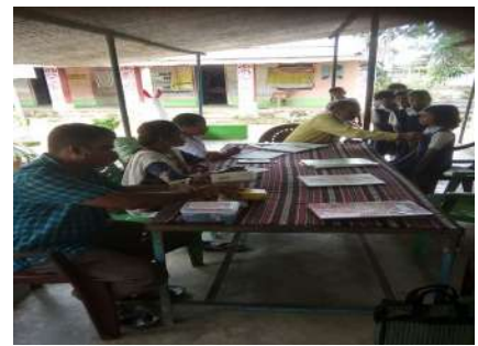
School level health camp