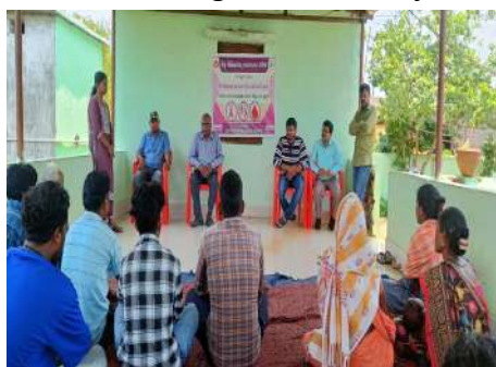
World Sickle cell Day

The OPD is functioning 24x7 hours with alternative support of the Allopathic Doctor, Ayush Doctor and other staffs. Every day more than 32 patients from nearby villages are visiting to this hospital for treatment. We also refer serious patients to SDH, Chitrakonda. We conducted regular monthly review meeting of all the Project staffs.