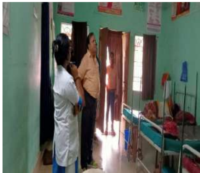
CDMO visit to Maa Gruha