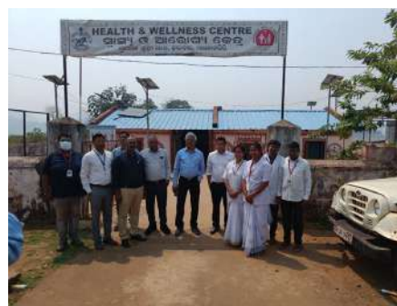
State Team Visit